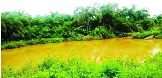
Fig. 2: The source of the river at Igede-Ekiti, Nigeria

The river takes its source (Fig. 2) from River Elemi in Igede-Ekiti which itself was said to take its source from the popular River Osun, in Oshogbo, Osun State. This river is located on a plane and is surrounded by a dense stretch of vegetation and agricultural farm. The river runs across the major road leading to Iwaroko-Ekiti along which the University is situated. Arbisala (2013) reported that the project area covers an approximate area of 2.2 km 2 , with the possibility of extending services to a neighbouring area of equivalent land mass. Climate is characteristically tropical. Mean monthly rainfall varies from 45 to 225 mm. Temperature is typically hot and reasonably uniform at 32°C ± 3 throughout the year. Relative humidity is as high as 95% in wet season and 45% in the dry. Estimated evaporation rate is 1527.6 mm per km 2 per day.